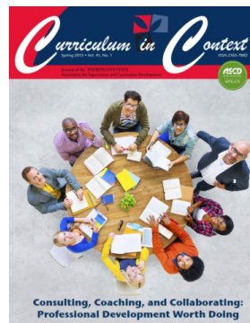
Equity, Access and Achievement for All (Journal pdf)