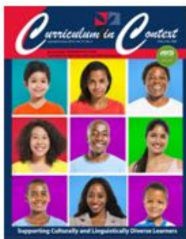
Supporting Culturally and Linguistically Diverse Learners (Journal pdf)